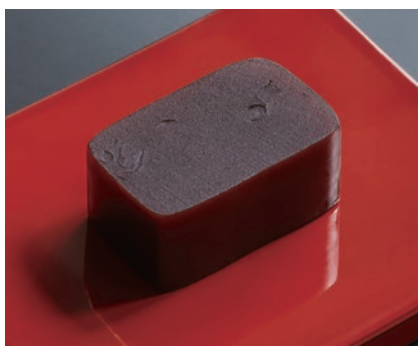
Yoru no Ume