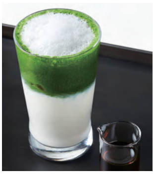
Iced Matcha au Lait